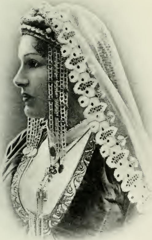
ARMENIAN PEASANT GIRL IN THE CAUCASUS